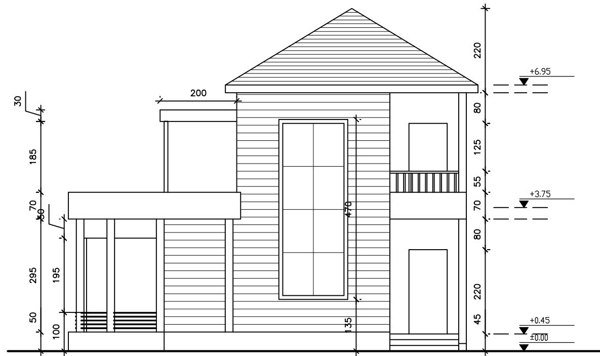
A Elevation A SCALE: 1/100